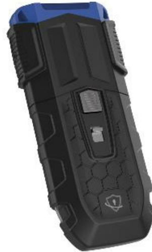
Artist Rendering of Planned Production Version of the BolaWrap 100