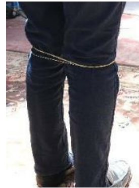
Entanglement Wrapping Illustration

There are limited effective options for remote engagement so when verbal commands go unheeded law enforcement is faced with either hands on engagement or other potentially injurious less lethal or lethal force. We believe our new tool is essential to meet modern policing requirements with individuals frequently not responding to verbal commands and to assuage public demands for less lethal policing. We believe our device minimizes the need to employ other uses of force including combat and less-lethal weapons. Many less-lethal weapons rely on “pain compliance” often escalating encounters with potential for injury.