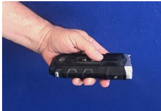
Illustration of Hand-Held Size of BolaWrap 100