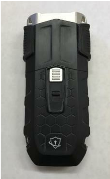
Generation 2 Pre-Production Functioning Version of BolaWrap™ Model 100