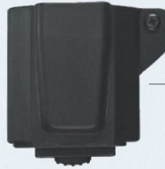
ACCESSORIES Holsters, belt clips, etc.