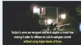
Mountlake Terrace, Washington