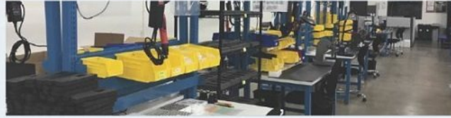
Production Capacity: 1-Shift Operation (current)

Production capacity in Q4 increased as a result of efficiency improvement efforts and manufacturing facility reconfiguration.