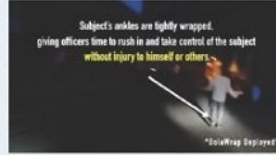
Glenwood Springs, Colorado